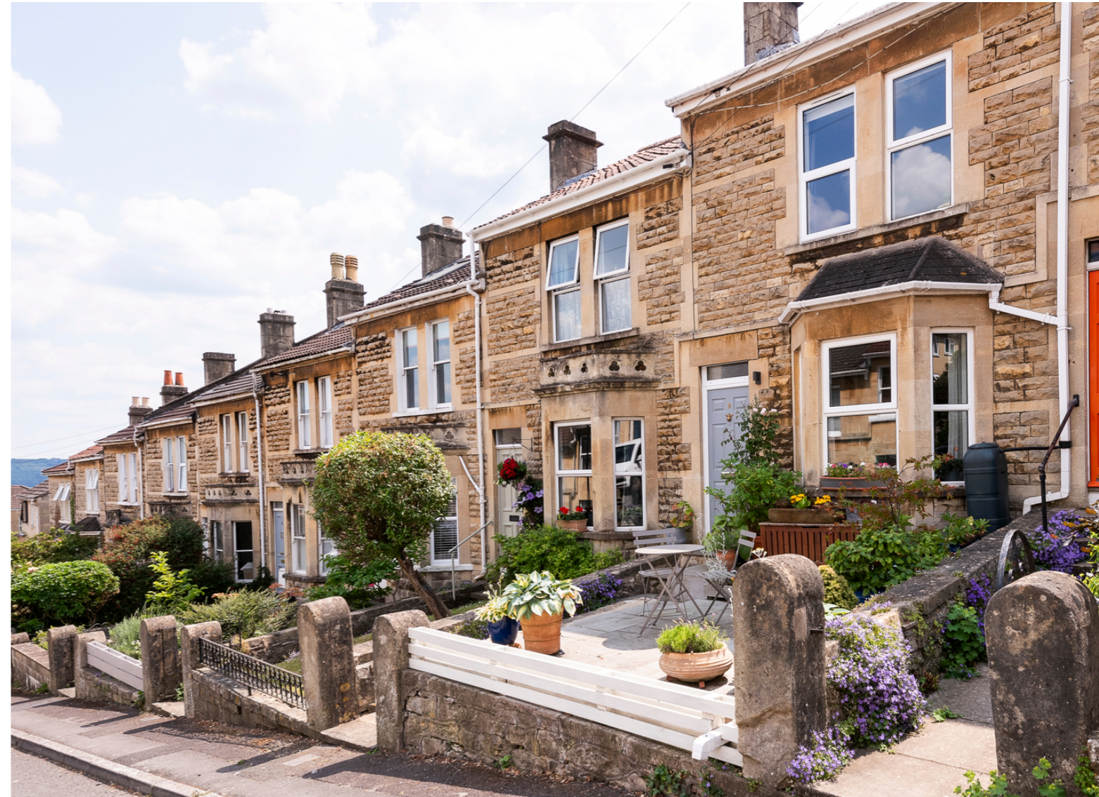
Fairfield Park Road, Bath