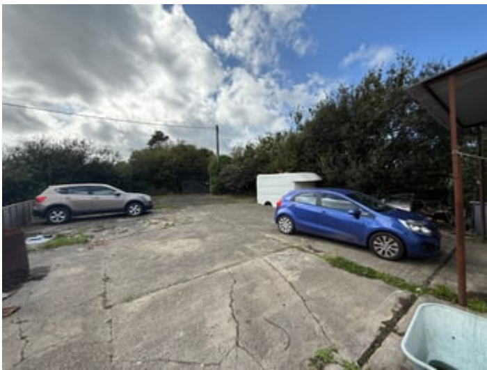
Range of Workshop Buildings

One measuring 30' x 20' with inspection pit and the other measuring 30' x 15' with a hydraulic lift fitted. Power and light connected.