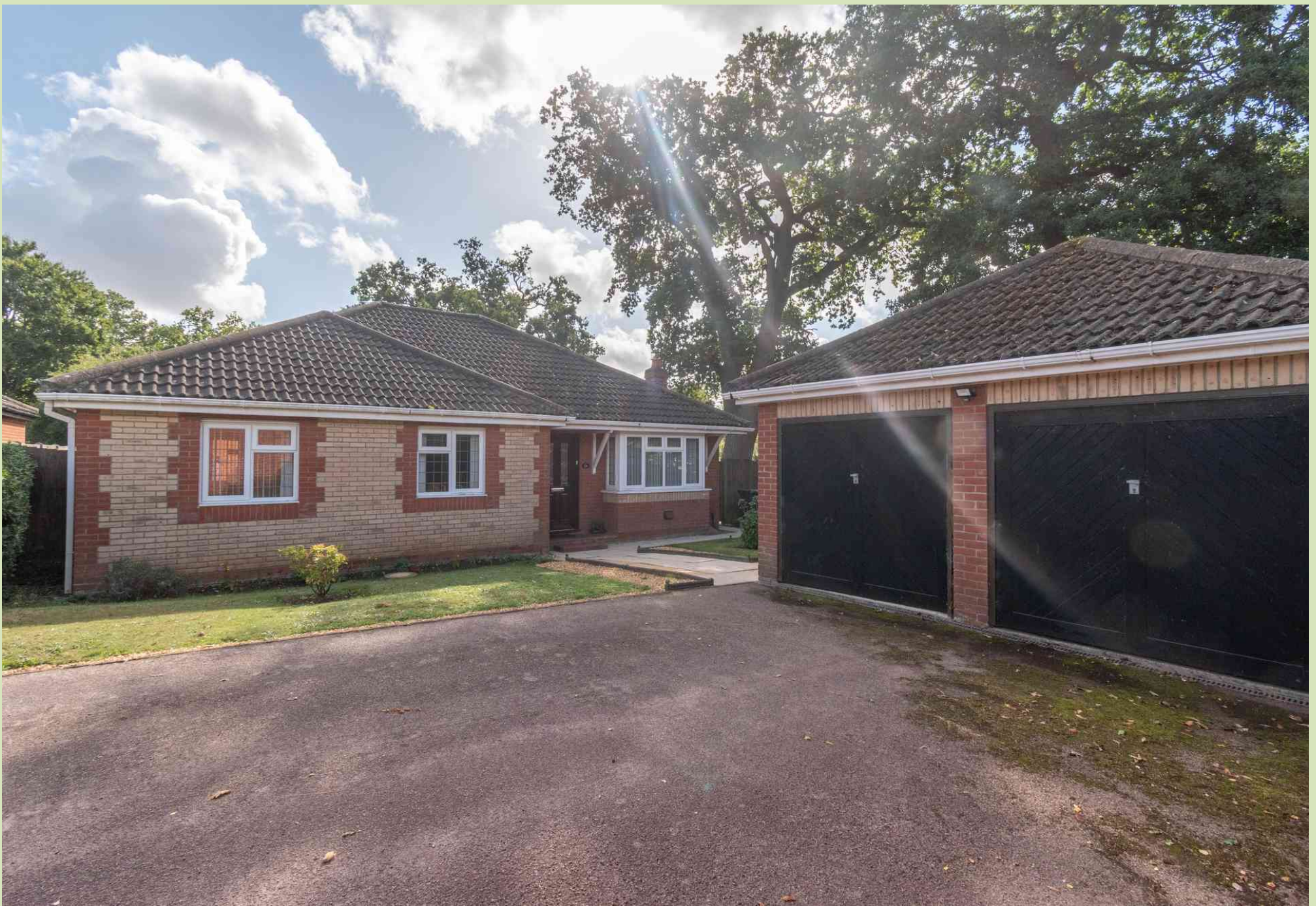
24 The Lawn, Fakenham Offers in Excess of £375,000