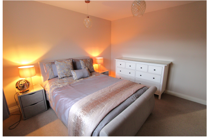
Master Bedroom with En-Suite