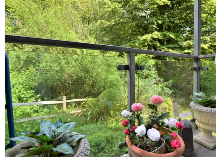
Remaining Lease Length - Approx 980 Years ** Service/ Maintenance Charge - Approx £1300 P.A ** Ground Rent - £150 P.A

Situated in an extremely sought after position of St Leonards; Tucked away in a quiet residential close but with excellent access to the A21, Battle and Queensway. St leonards is a bustling town with a recently found assortment of mainly independently owned restaurants, bars and shops; further amenities include dentist and doctors. There are regular bus services close by with services to Hastings town centre and battle, both of which have excellent train stations with direct services to Central London.