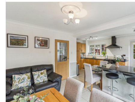
5 Old Vicarage Gardens, Henlow, Bedfordshire, SG16 6AD