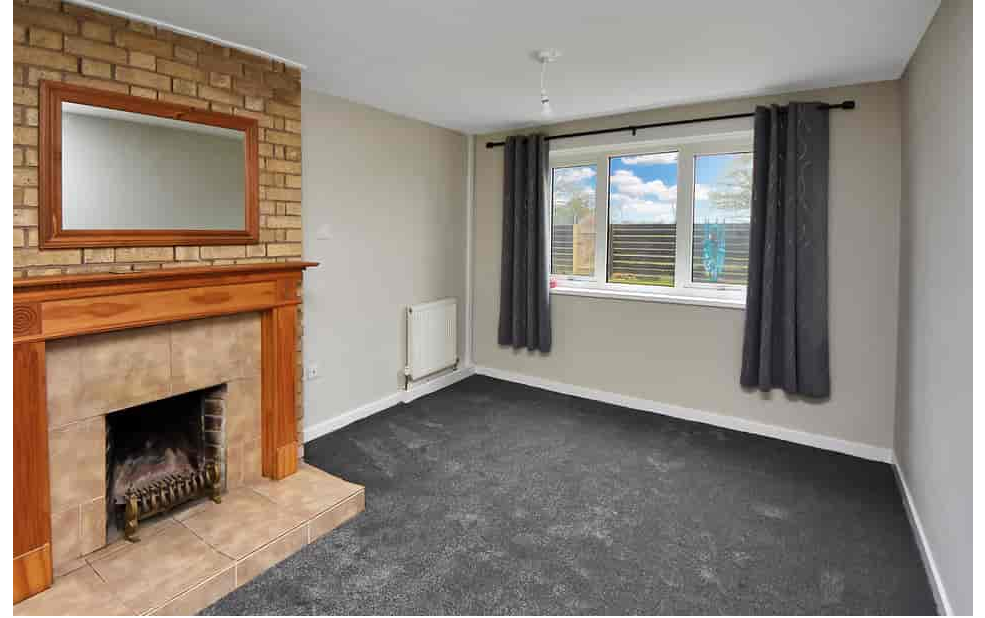
28 Lindsay Walk, Southam, Warwickshire. CV47 2UH Guide Price £237,500 - Freehold