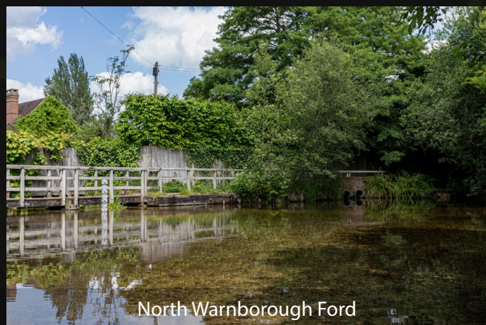
North Warnborough Ford