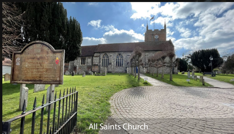
All Saints Church

Road links are excellent with the M3 within 2 miles.