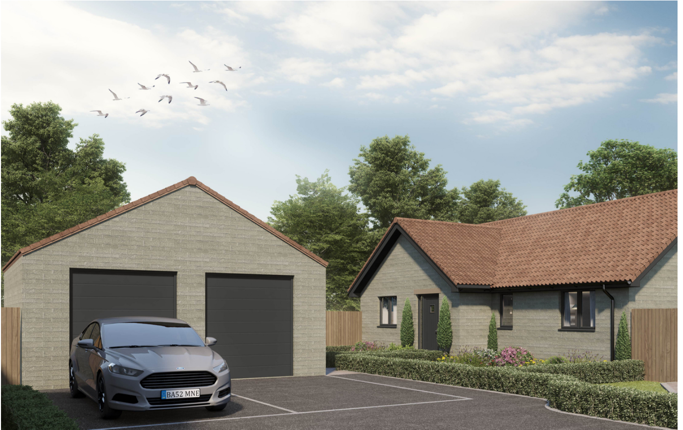
Plot 5 2 Bedroom Home