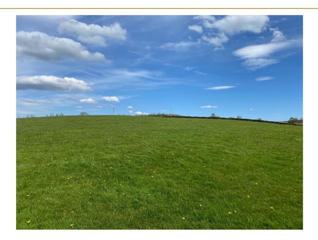
12.67 acres Land at Gaylands Lane Earby, Barnoldswick BB18 6JR Guide Price £125,000

An excellent piece of quality grassland available to purchase in a handy sized block privately located. Situated with a south facing aspect on the outskirts of Earby village this 12.67 acres of agricultural meadow and pasture will be of interest to the farmer and investment or amenity buyer alike. The land comprises of one single field and access directly on to Gaylands Lane via a 12' field gate and hardcore entranceway. All boundaries are of stockproof condition either stone wall or stock netting and shown on the attached plan edged red. The land is offered for sale freehold with vacant possession given on completion and restricted to agricultural or equestrian use only.