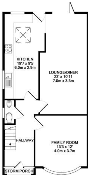
GROUND FLOOR APPROX. FLOOR AREA 681 SQ.FT. (63.3 SQ.M.)