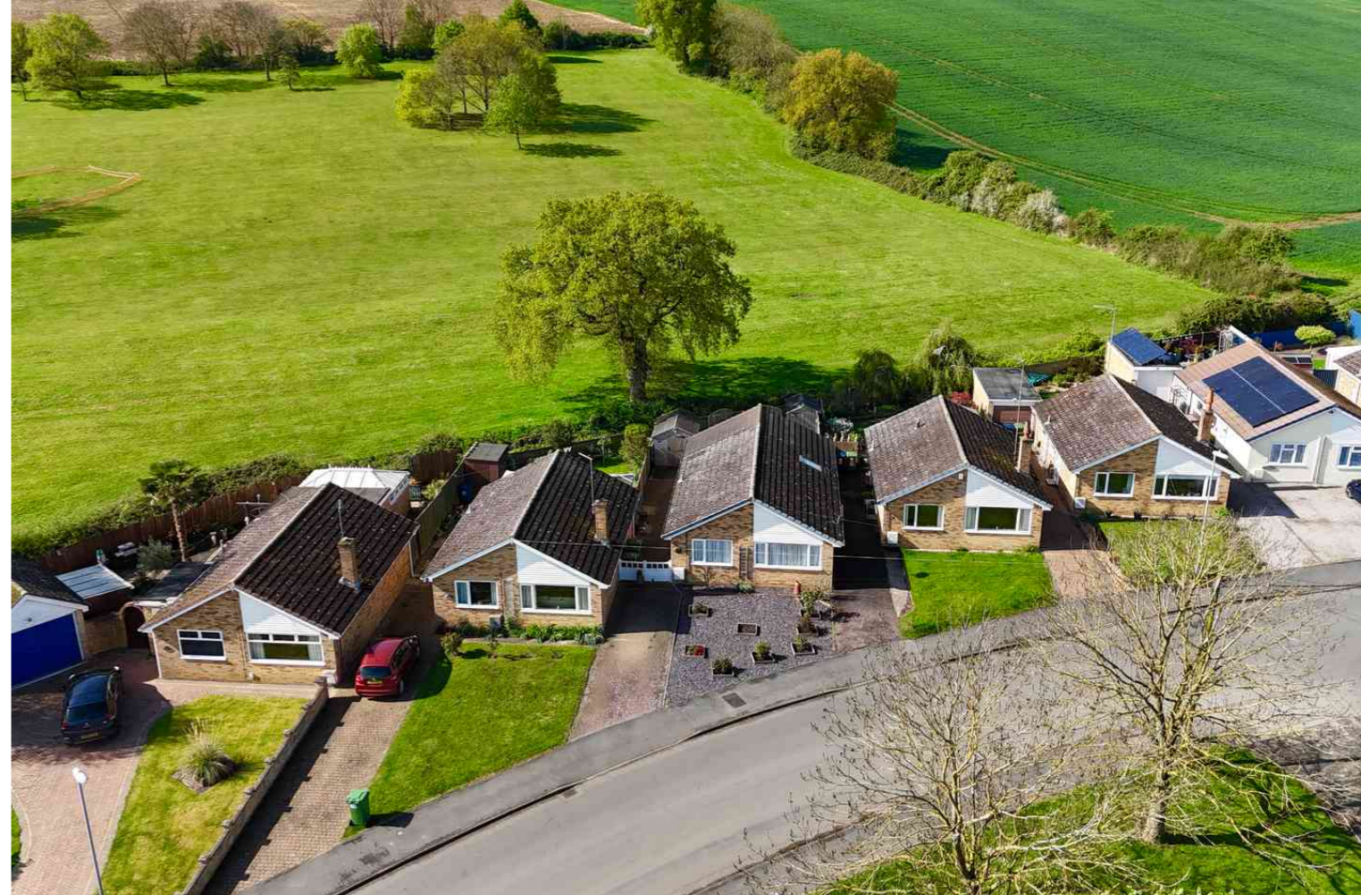
Rockingham Road, Sawtry PE28 5SQ