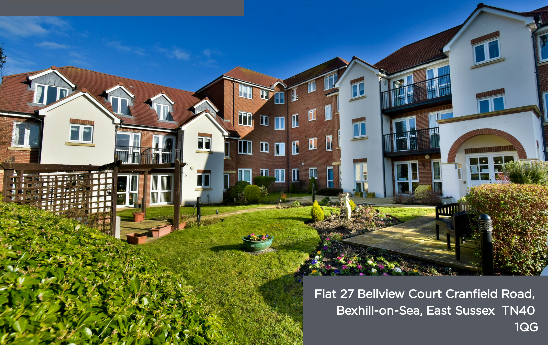
Flat 27 Bellview Court Cranfield Road, Bexhill-on-Sea, East Sussex TN40 1QG