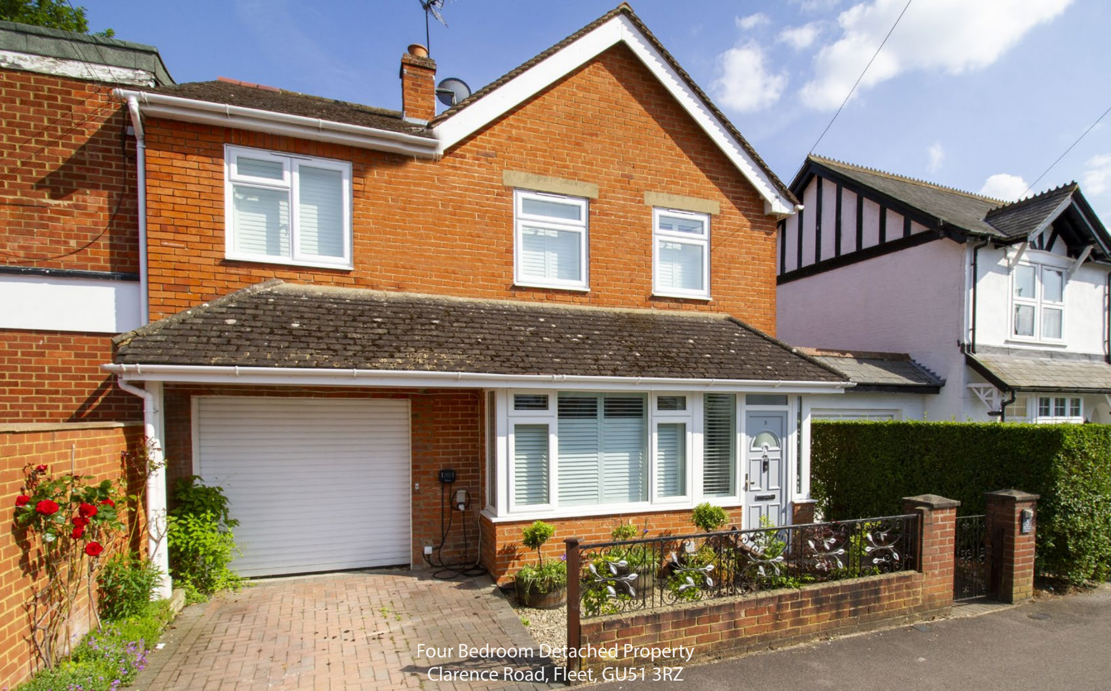
Four Bedroom Detached Property Clarence Road, Fleet, GU51 3RZ