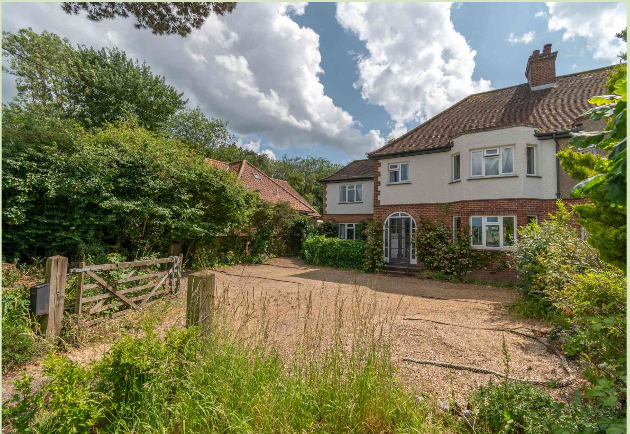
Fair Green, Wells-next-the-Sea Guide Price £655,000