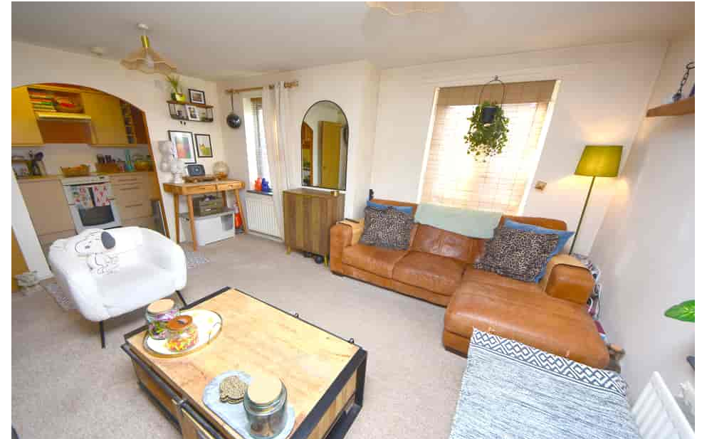
62 Cherwell Court Britannia Road, Banbury, Oxfordshire. OX16 5DE Fixed Price £72,000 - Leasehold