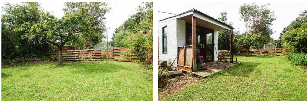
GARDEN AND SUN HOUSE

TENURE We are informed the tenure is Freehold