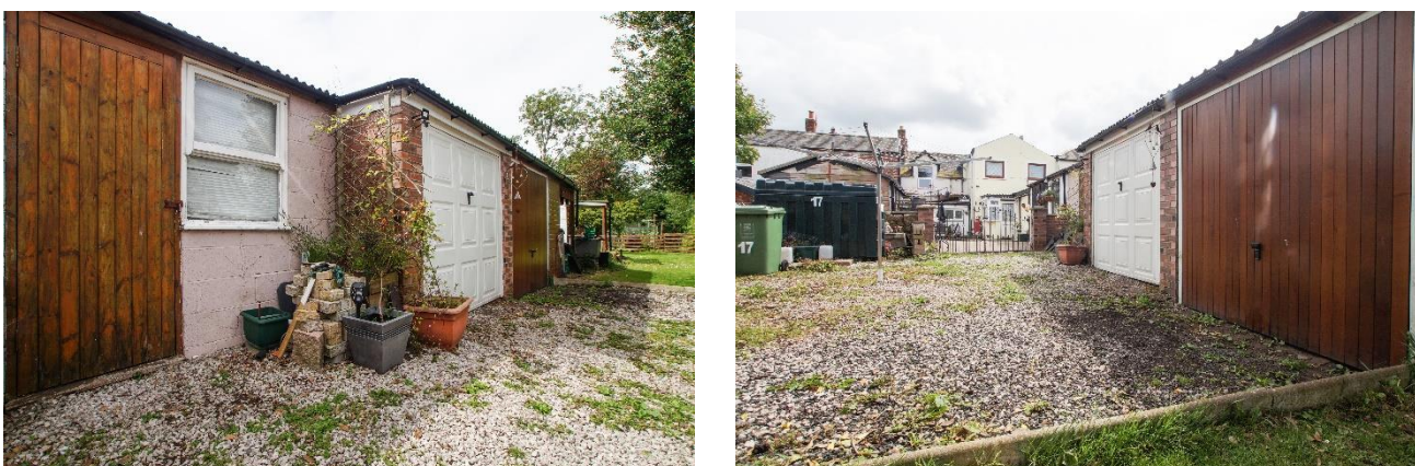
COURTYARD WITH OUTHOUSES AND GARAGES