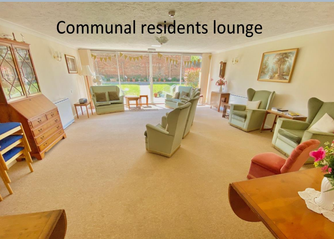
Communal residents lounge