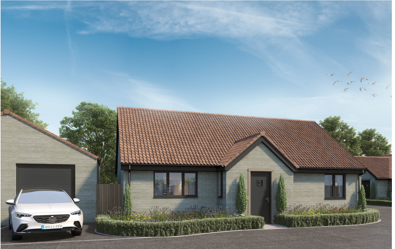
Plot 4 3 Bedroom Home