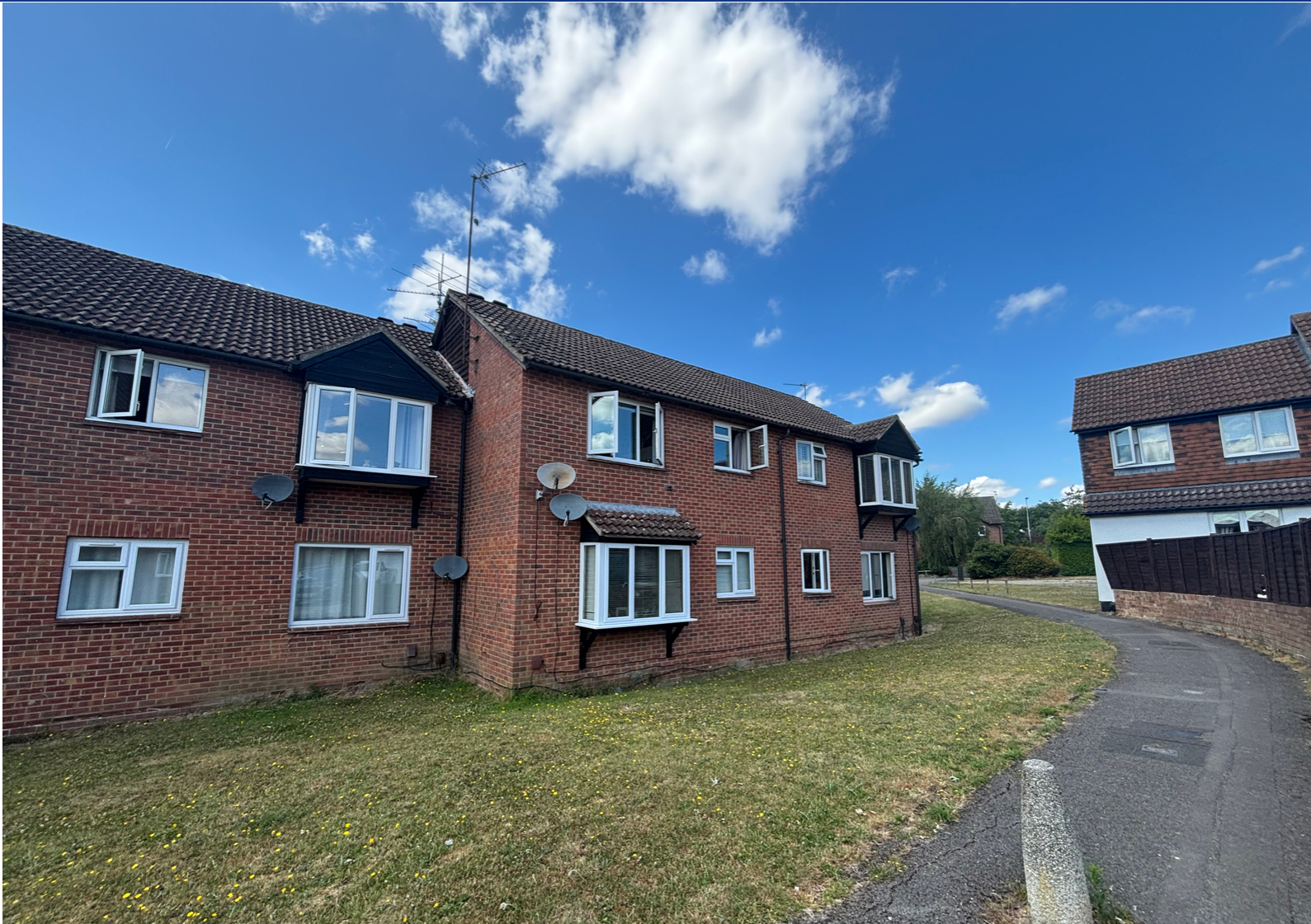
Caistor Close, Calcot, Reading, Berkshire. RG31.