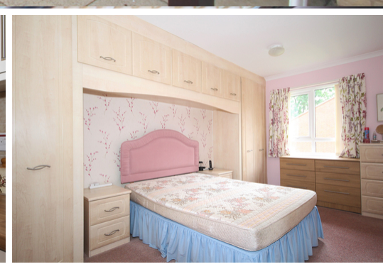
7 The Rickyard, Norton Road, Letchworth Garden City, Hertfordshire, SG6 1AW £340,000 Leasehold