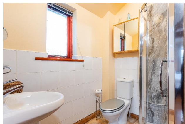
MASTER BEDROOM WITH EN-SUITE

OFFICE/BEDROOM 5 (8'10 x 8'3) Double glazed window to the front, radiator and built in timber frame for a single mattress.