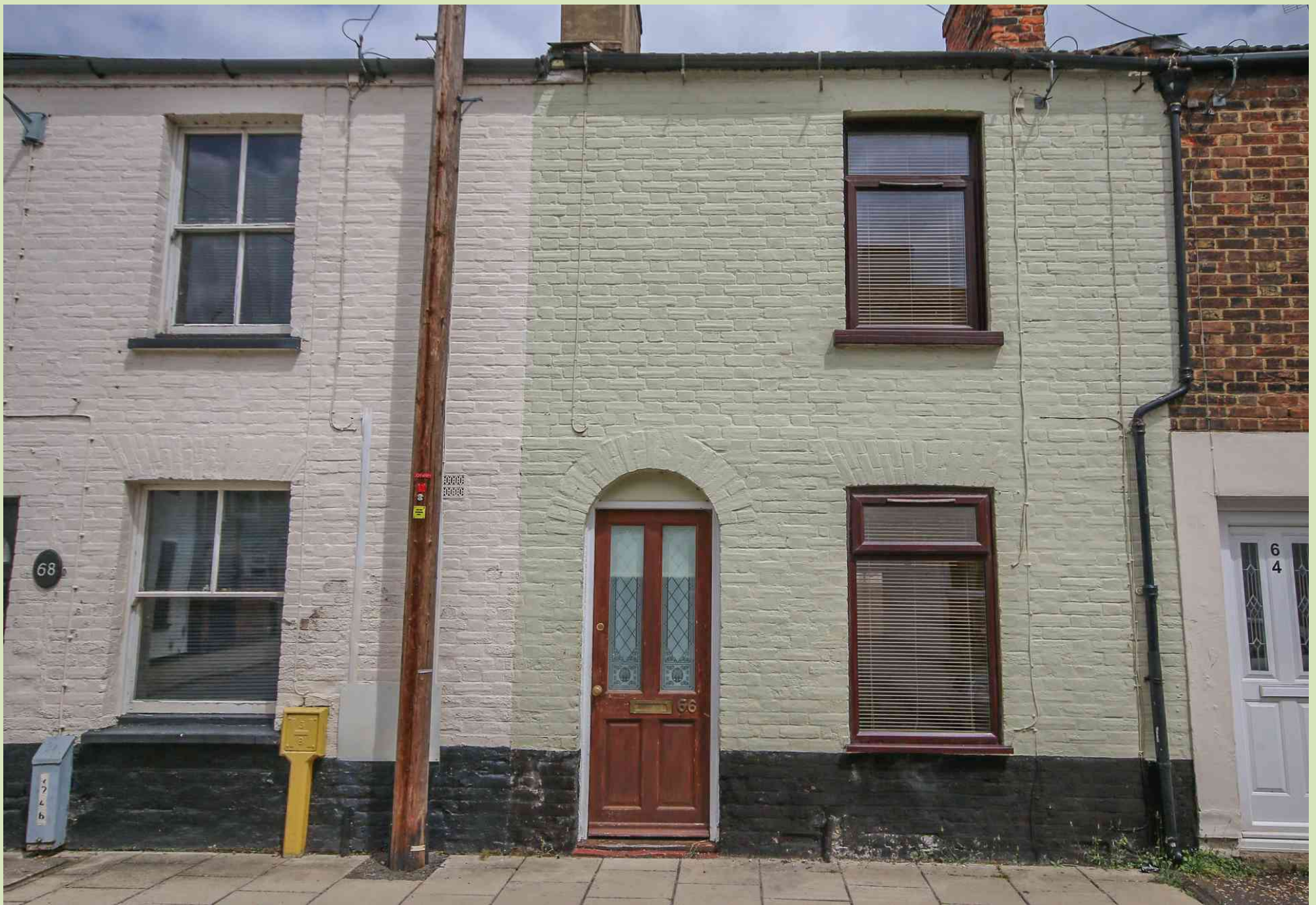
66 Checker Street, King's Lynn Guide Price £124,950