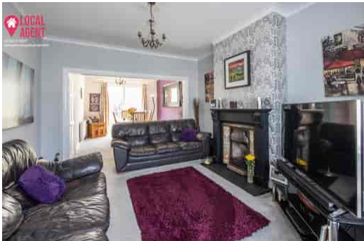
12 Roseacre Road, Welling, Kent, DA16 2AD £550,000 Freehold