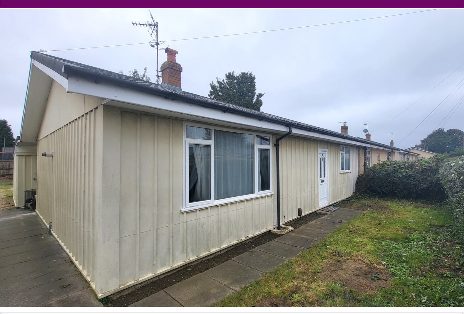
59 Welland Close, Peterborough, Cambridgeshire PE1 3SD