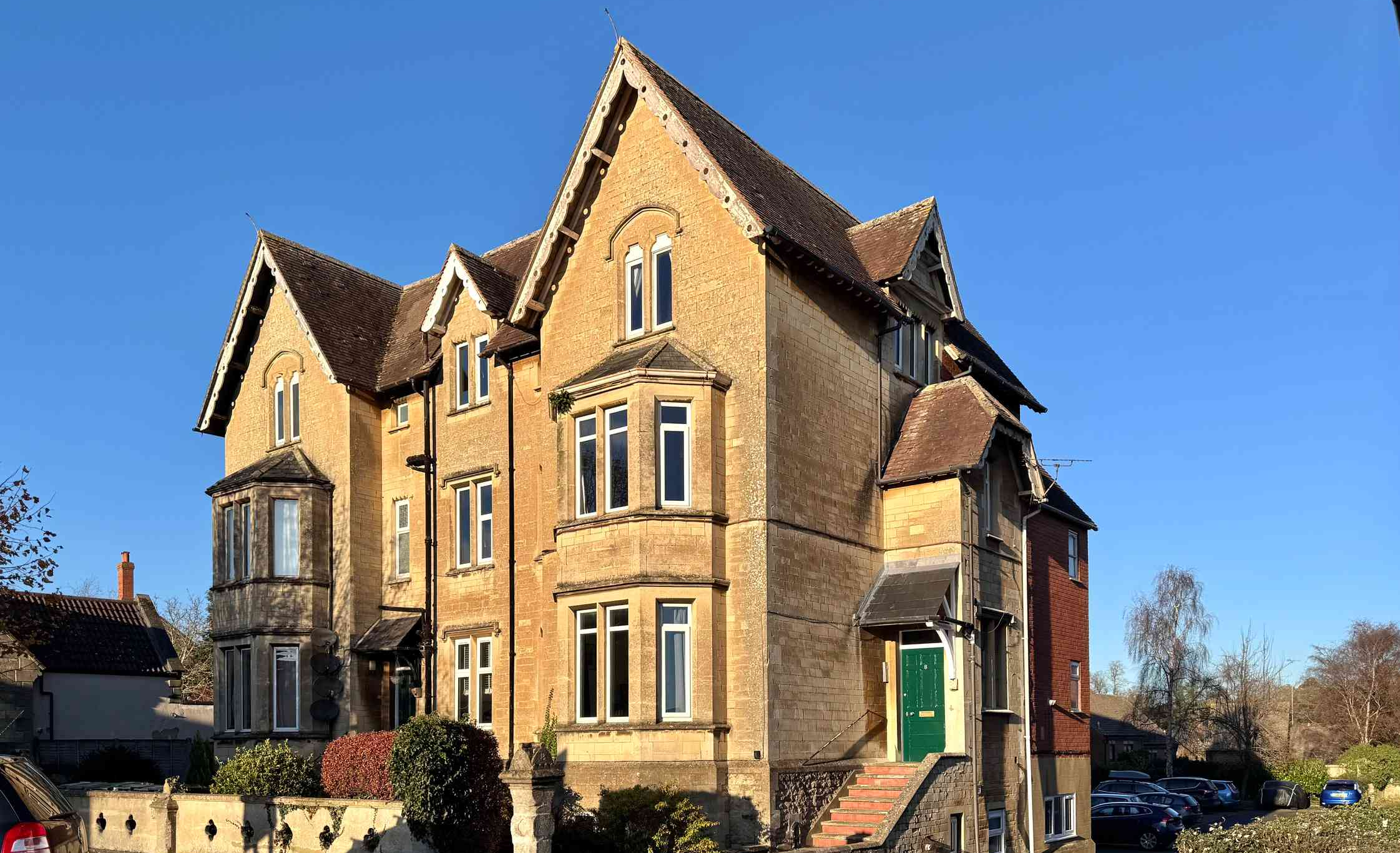
Gravel Walk, Faringdon Oxfordshire, Guide Price £145,000