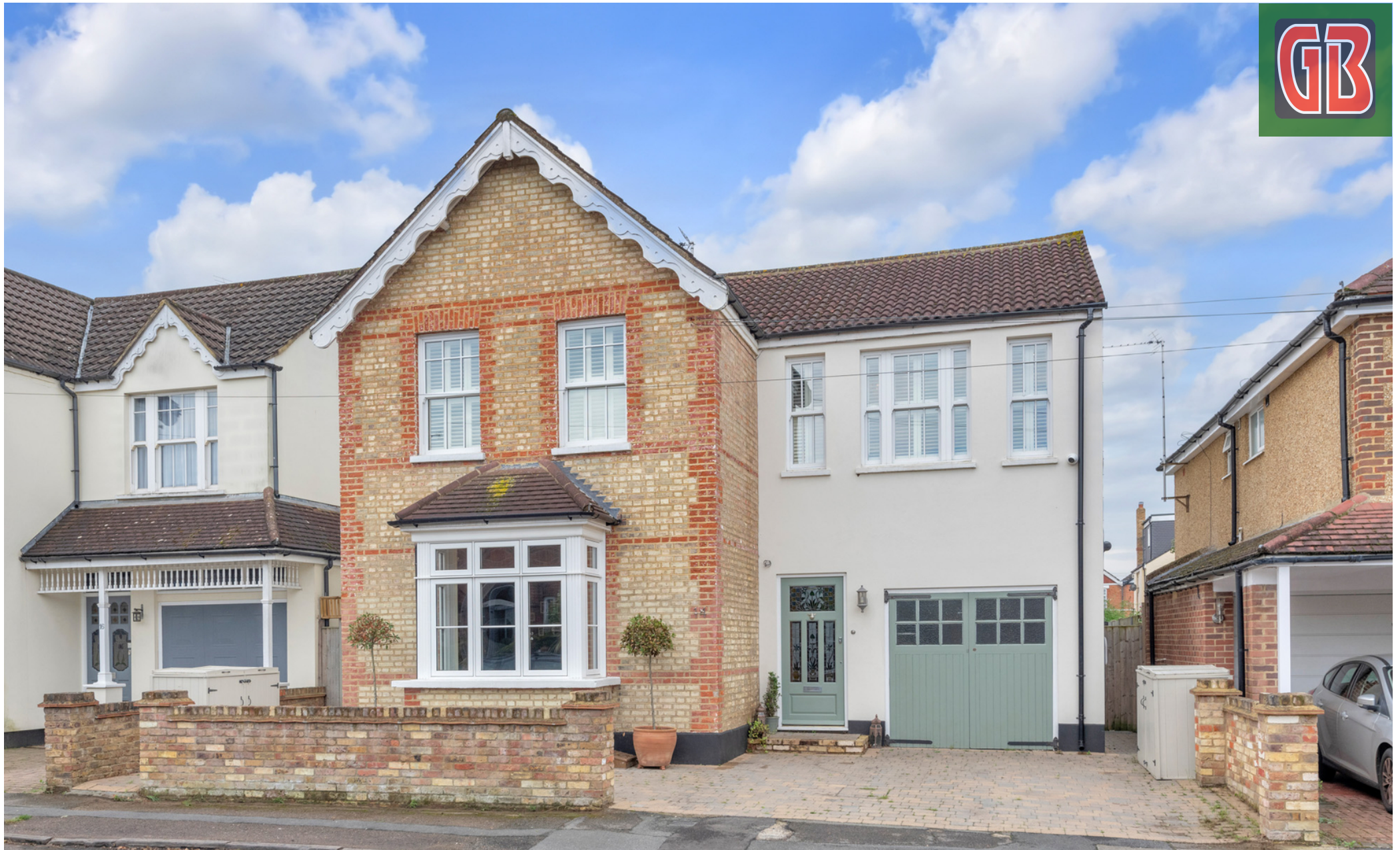
14 Wolsey Road, Ashford, Surrey. TW15 2RB. 4 Bedroom Detached House - £975,000 Freehold