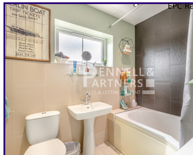
EPC Rating: D (68)

Hard landscaped and fully enclosed rear garden designed for easy maintenance and offering a good degree of privacy.