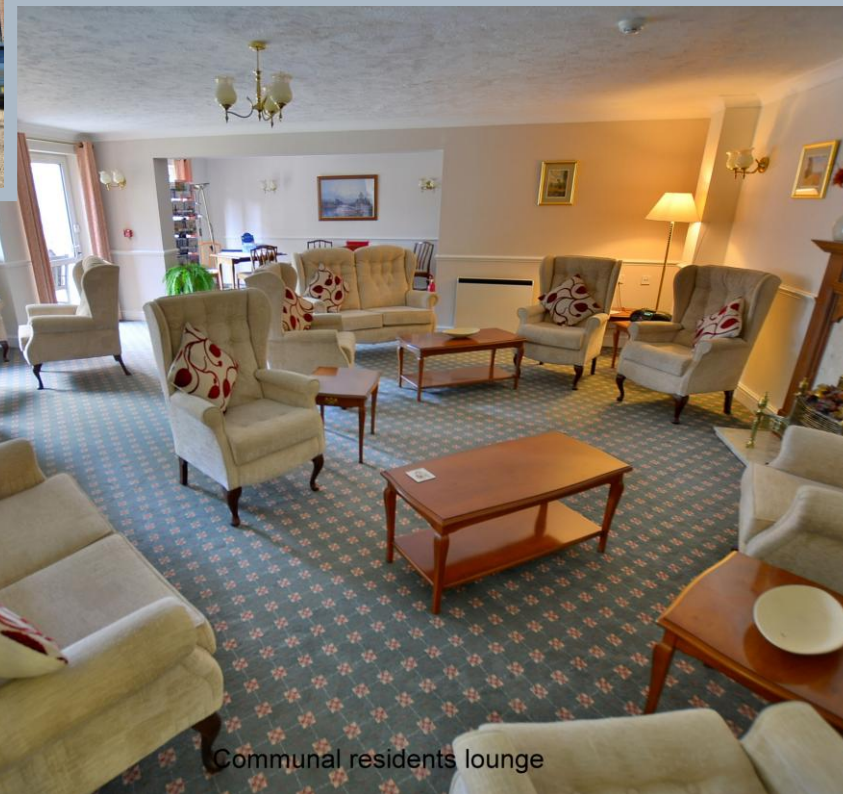
Communal residents lounge