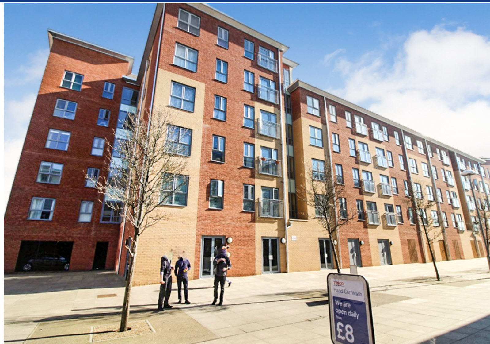
Englefield House, Moulsoford Mews, Reading.