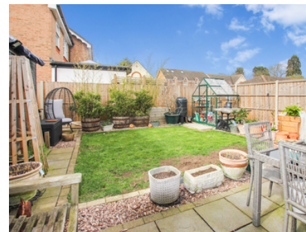
3 Mill Close, Stotfold, Hitchin, Bedfordshire, SG5 4AB