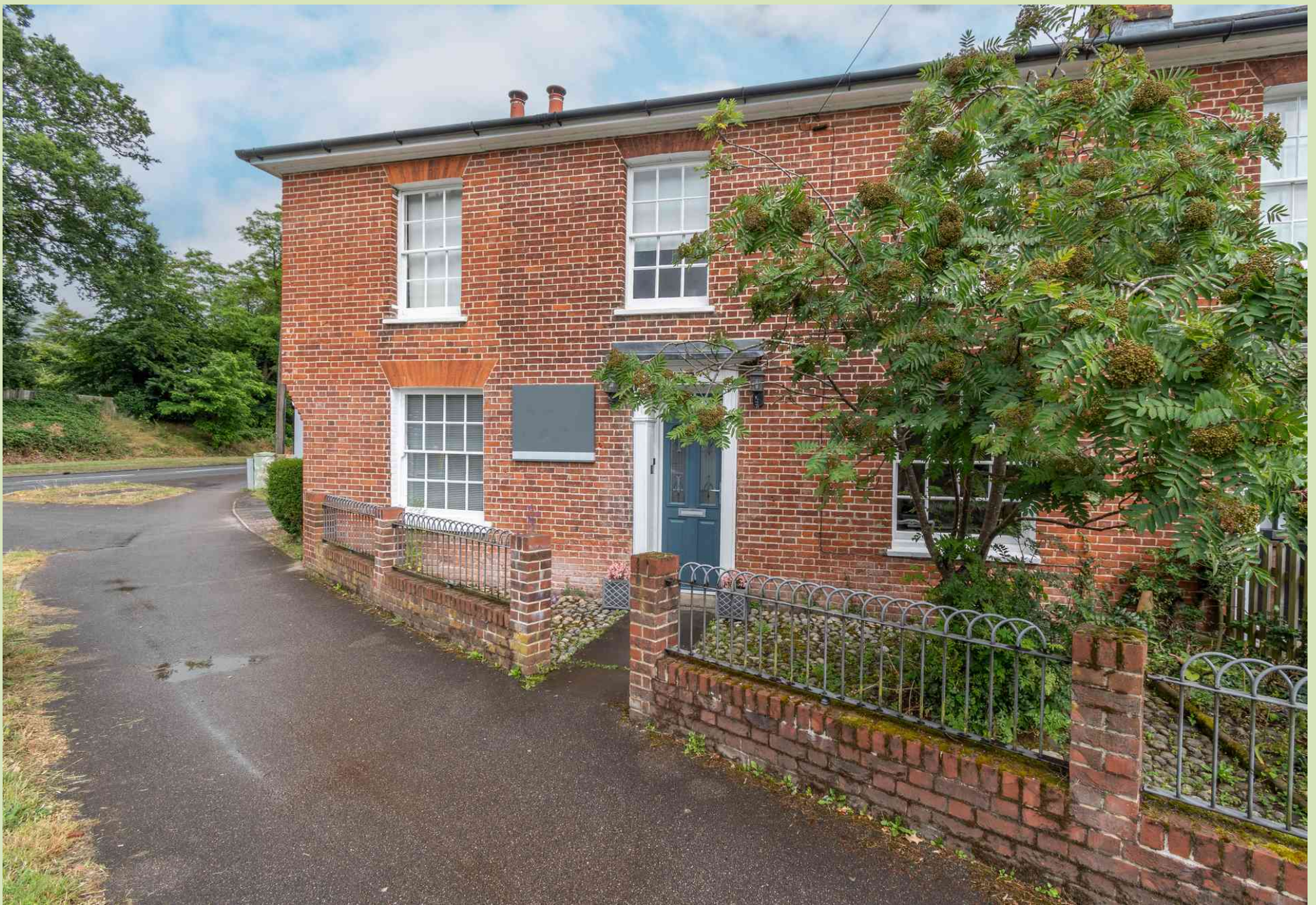
46 Wells Road, Fakenham Guide Price £285,000