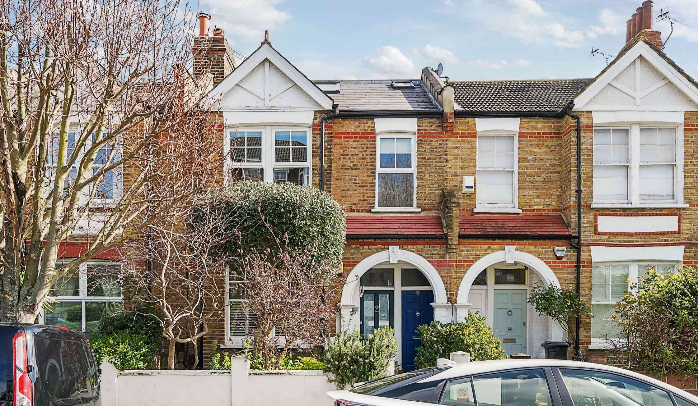
Emlyn Road, London, W12 9TA