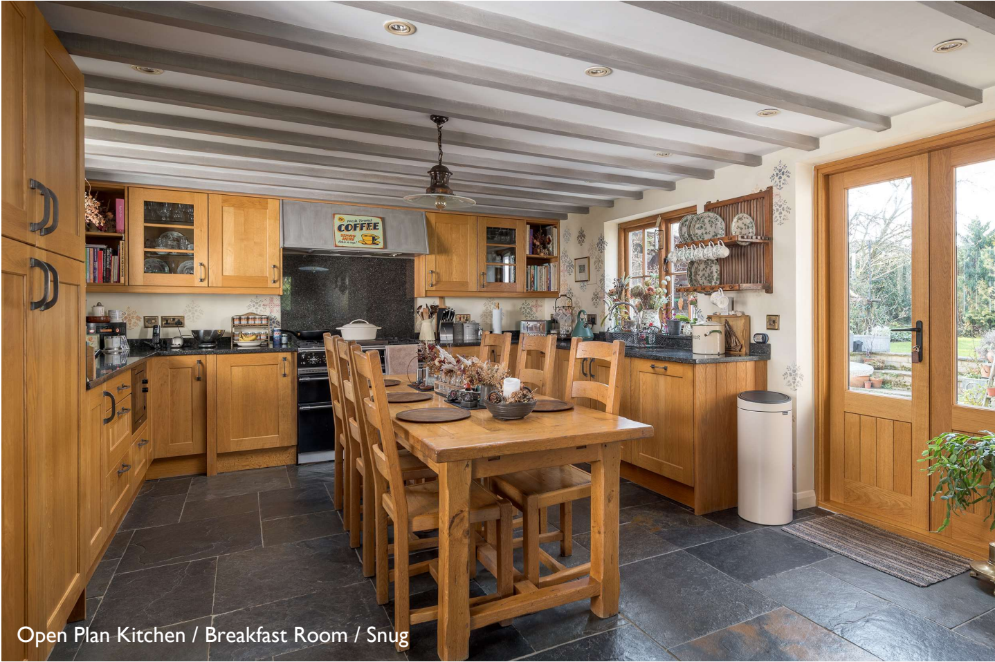
Open Plan Kitchen / Breakfast Room / Snug