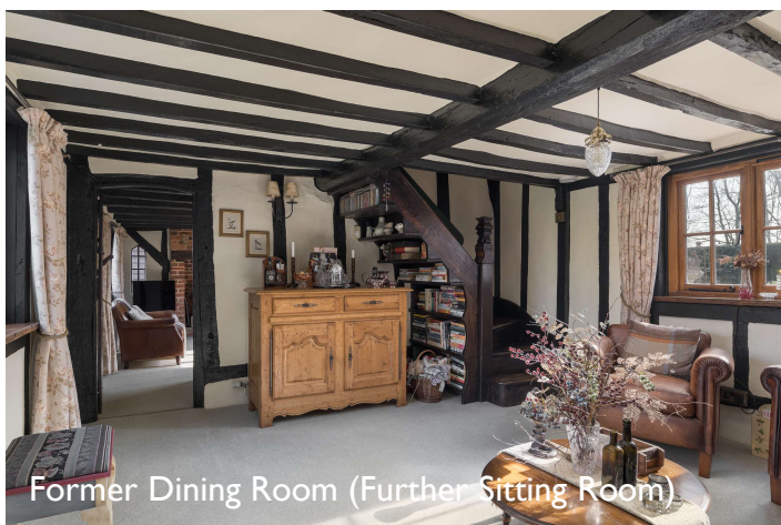
Former Dining Room (Further Sitting Room)