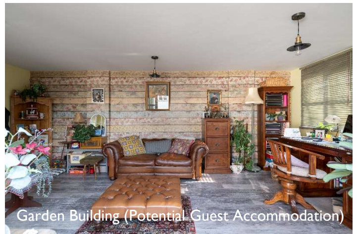
Garden Building (Potential Guest Accommodation)