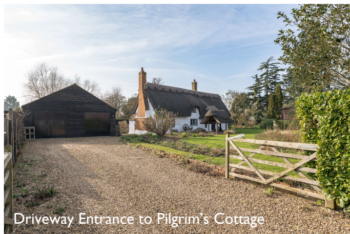
Driveway Entrance to Pilgrim's Cottage

PERFECTLY CONNECTING PEOPLE AND PROPERTY