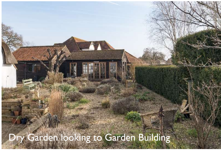
Dry Garden looking to Garden Building