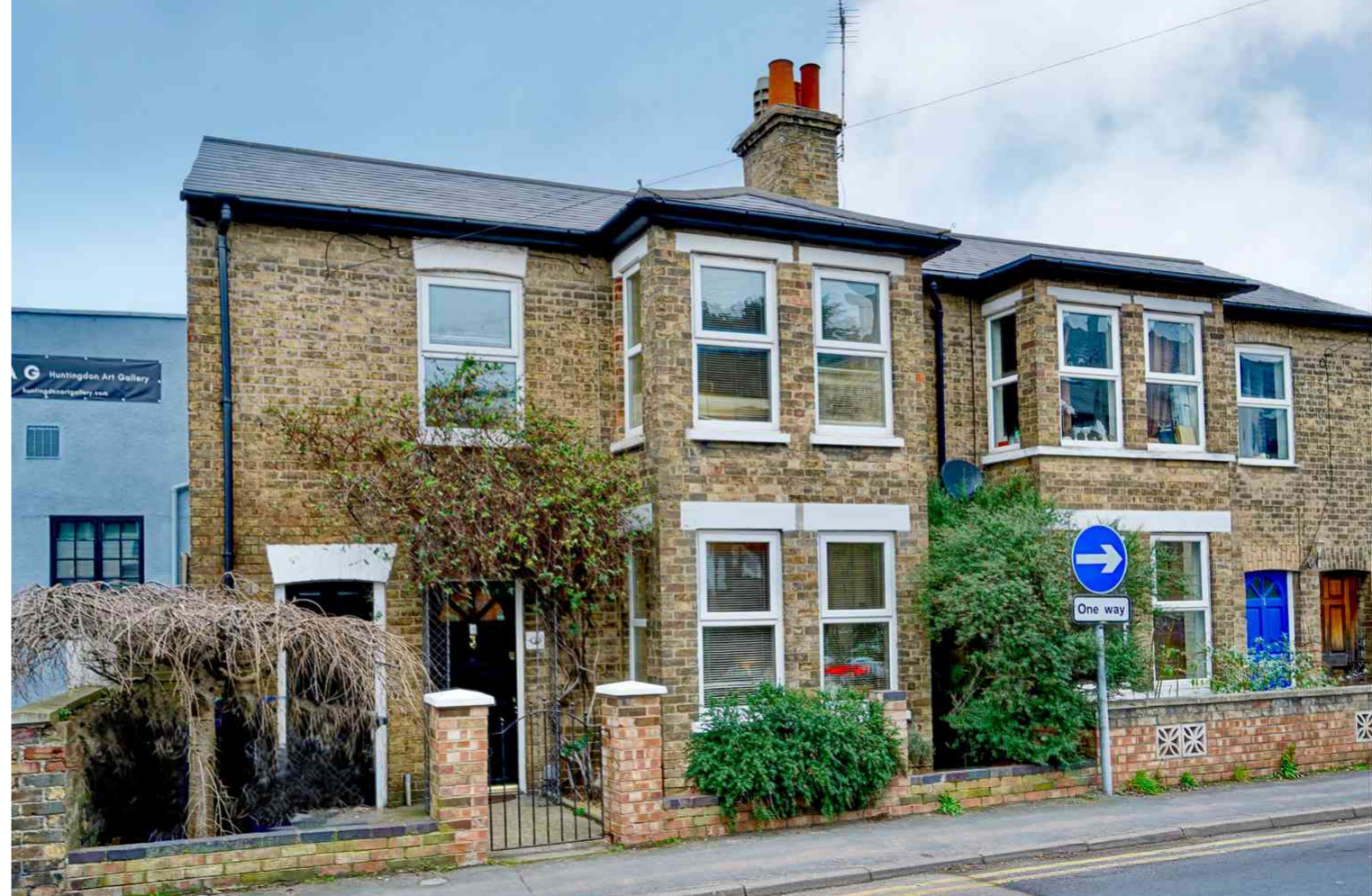
St Marys Street, Huntingdon PE29 3PE