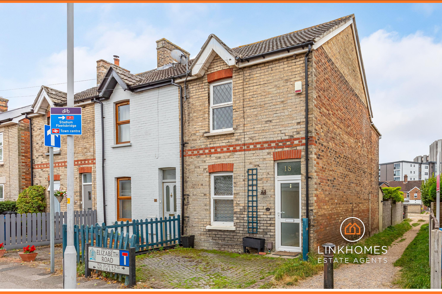
18 Elizabeth Road, Poole, Dorset, BH15 2DJ Guide Price £310,000

** SOUTH WESTERLY FACING PRIVATE REAR GARDEN ** Link Homes Estate Agents are pleased to offer this tastefully decorated two double bedroom end of terrace house situated in the popular Heckford Park location close to Poole Town Centre. This unique Victorian property boasts an array of stand out features including two good-sized bedrooms, an open plan living room/diner, a separate kitchen leading onto the sun/utility room, off road parking for two vehicles, an outside toilet and a South-West facing private rear garden. A perfect first home or investment, an internal viewing of this stunning character home is strongly recommended.