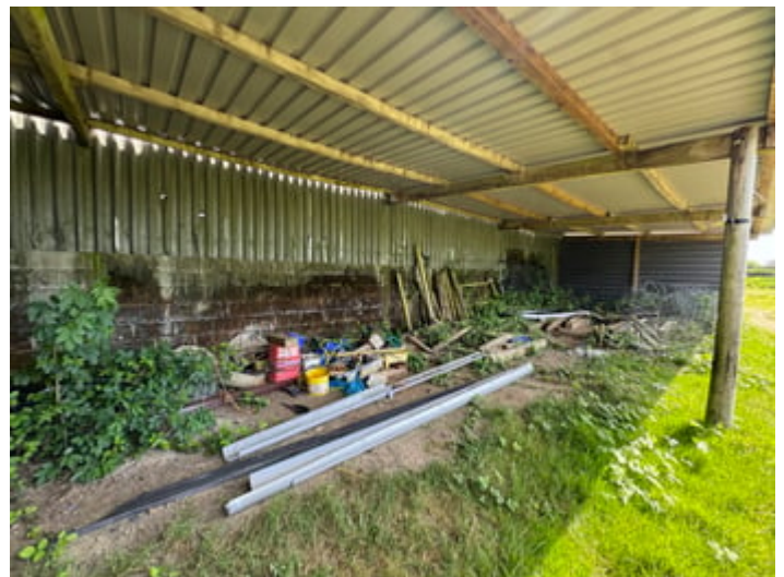
60' 0" x 30' 0" (18.29m x 9.14m) of steel frame with box profile cladding and cement fibre roof.