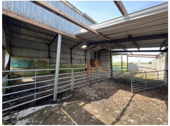
To the Rear