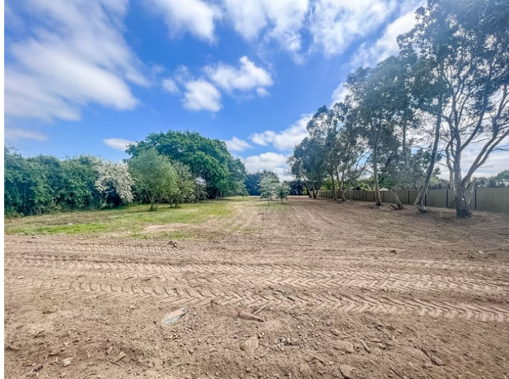
All sites visits are to be arranged strictly via the estate agency.