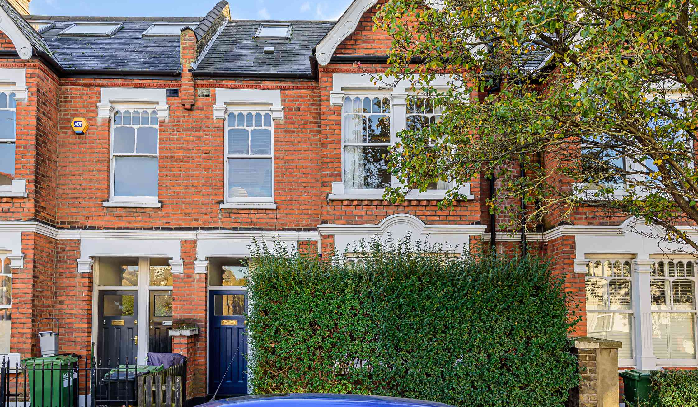
Jeddou Road, London, W12 9EQ