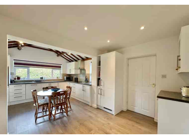
• Extended five bedroom detached property • Corner position, delightful garden, beautiful views • Mains drainage, double glazing, gas central heating