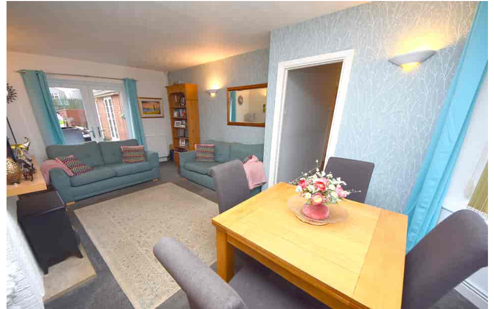
23 Miller Road, Banbury, Oxfordshire. OX16 0QX Guide Price £350,000 - Freehold