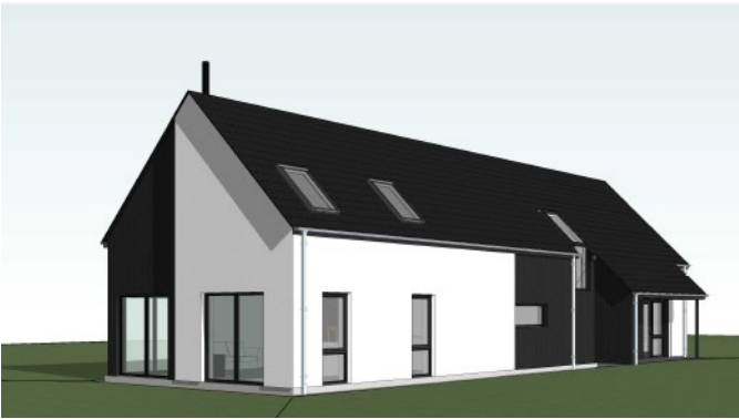
3D View - Plot 1