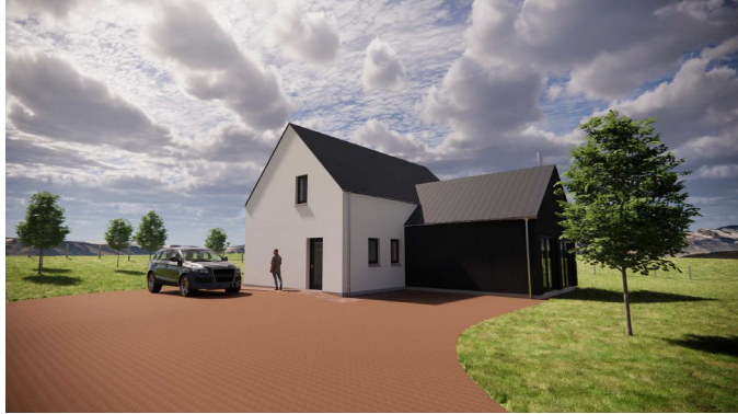
3D View - Plot 2

Planning permission in principle was granted on 16th May 2023 under planning reference 23/02383/FUL. Full details are available on request or via the Highland Council planning website – using the planning reference.