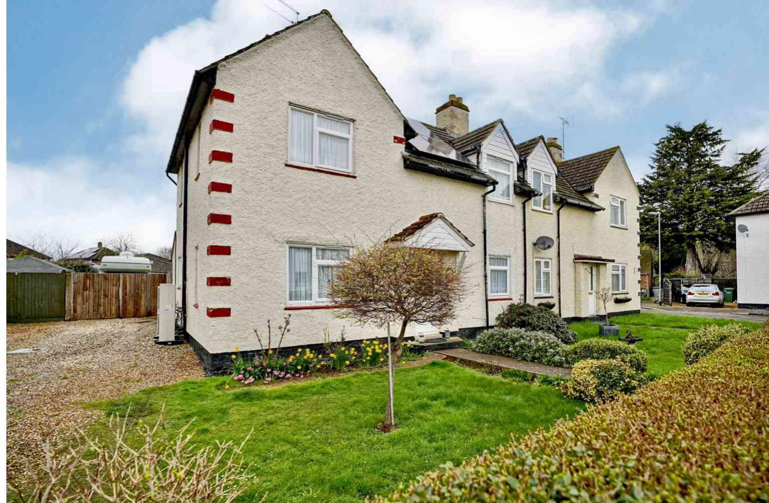
Manor Close, Wyton PE28 2AG