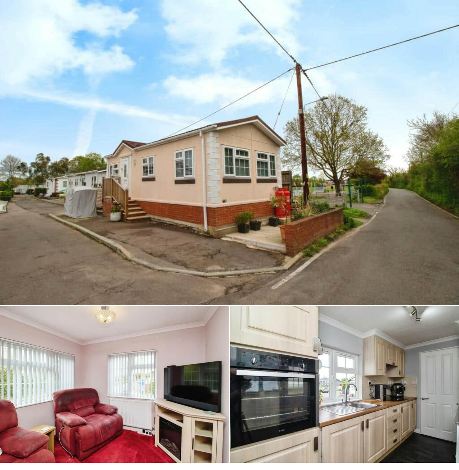
Offers in Excess of £147,000