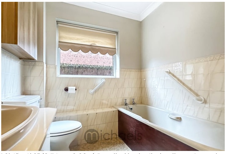
12' 4" x 6' 8" (3.76m x 2.03m) Panelled bath, tiled walls, vanity wash unit, radiator, low level W.C, obscured window to rear aspect.