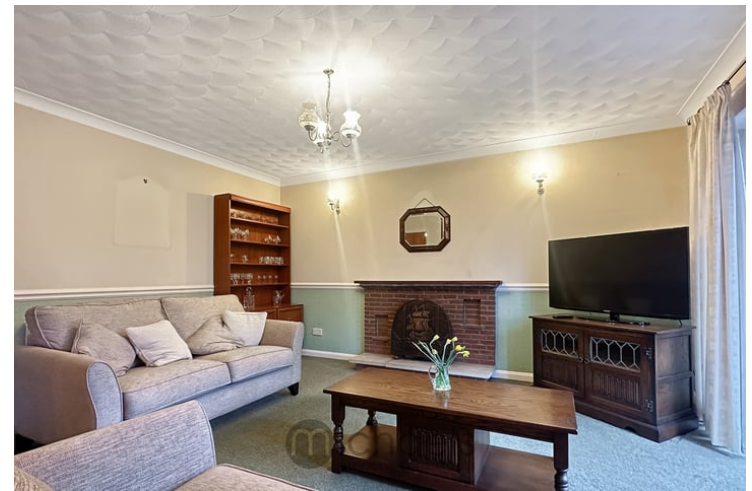
14' 9" x 12' 4" (4.50m x 3.76m) UPVC sliding doors to rear aspect, radiator, exposed brick fireplace.