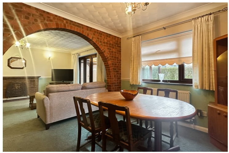
10' 8" x 9' 6" (3.25m x 2.90m) Exposed brick arch into dining room, UPVC window to rear aspect, radiator, door leading to: