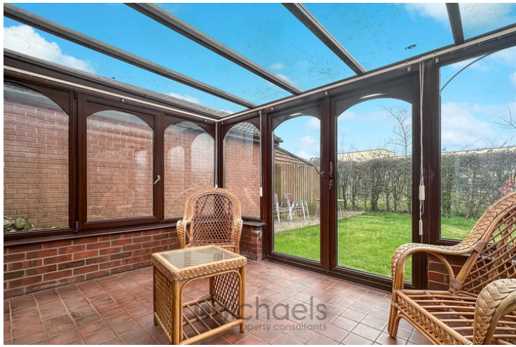
12' 5" x 9' 5" (3.78m x 2.87m) Tiled flooring, UPVC French doors to garden.