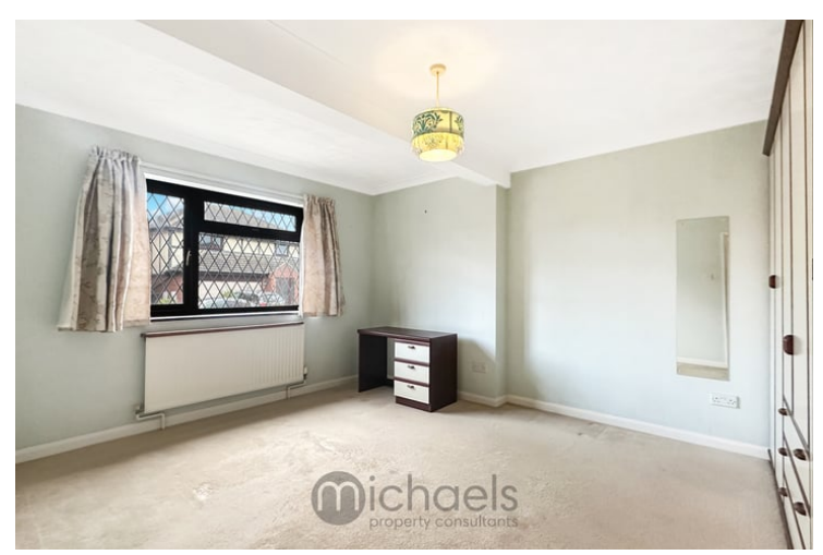
14' 2" x 12' 3" (4.32m x 3.73m) UPVC window to front aspect, radiator.