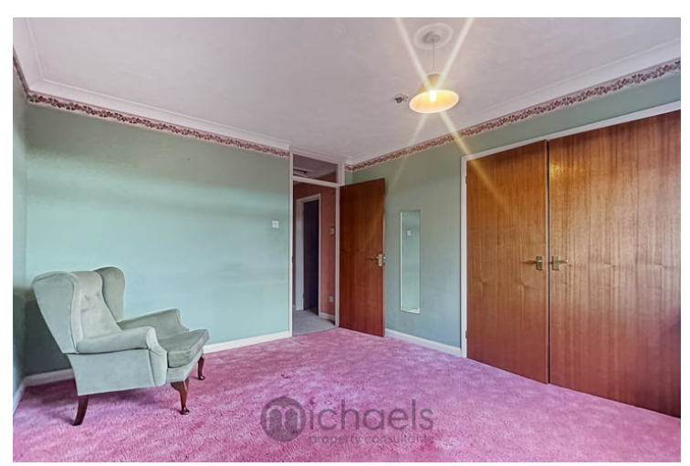
13' 2" x 10' 7" (4.01m x 3.23m) UPVC window to side aspect, radiator, inset wardrobes.