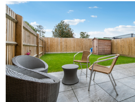
4 Blackbird Gardens, Langford, Nr Biggleswade, Bedfordshire, SG18 9RD