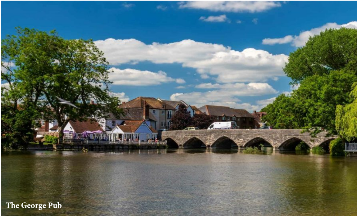
The George Pub