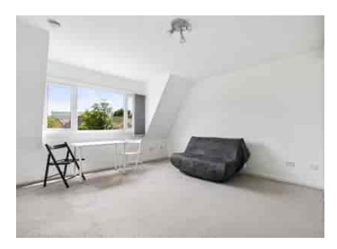
Abbeyfields Close, Park Royal, London. NW10 7EG.