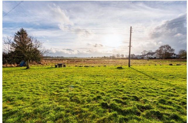
SIDE OF THE PROPERTY, DRIVE & VIEWS

OUTBUILDING (18' x 14') Double glazed UPVC window to the front, double glazed UPVC door to the side, power and lighting, stove and power points.