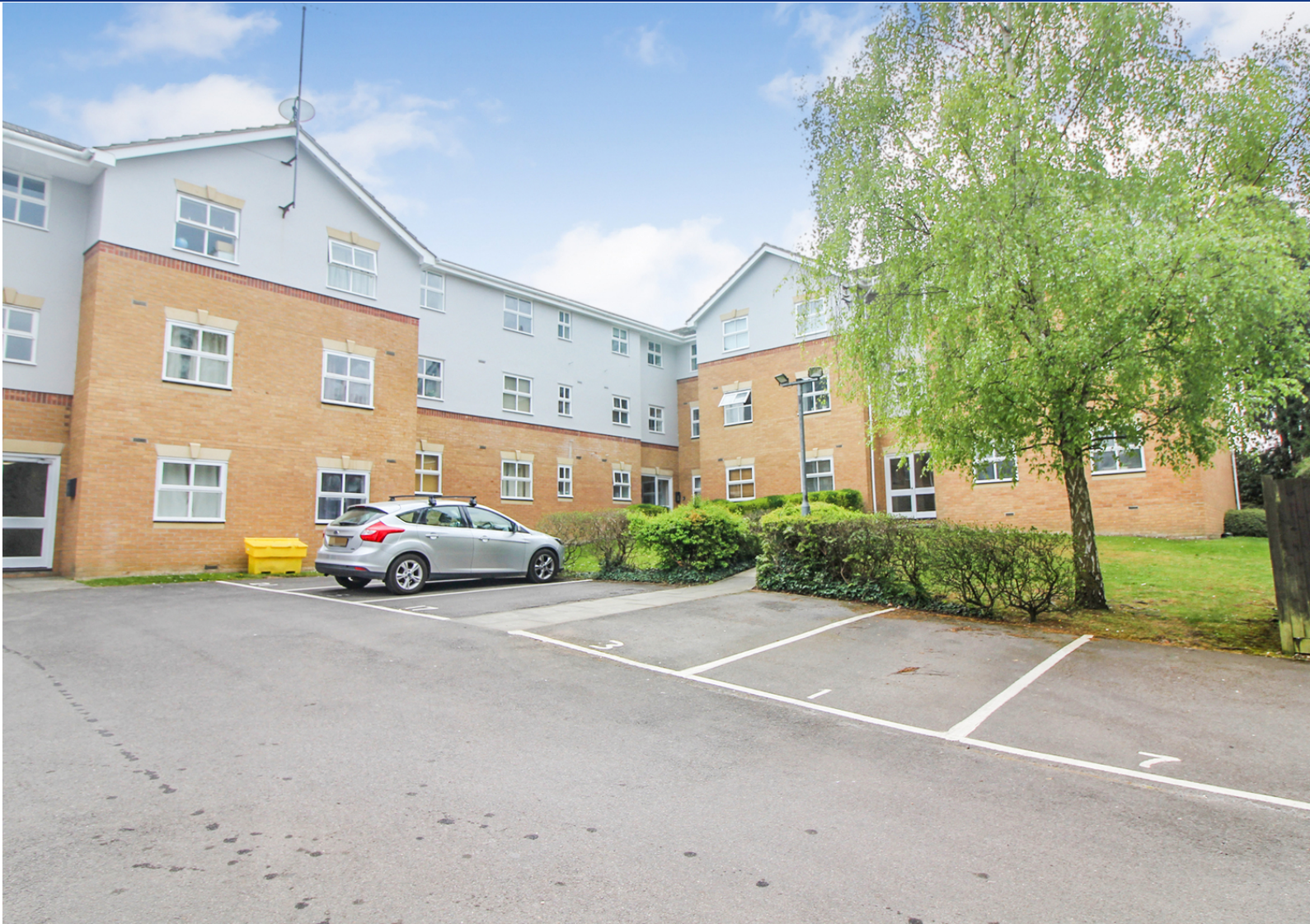
Elm Park, Reading, Berkshire.